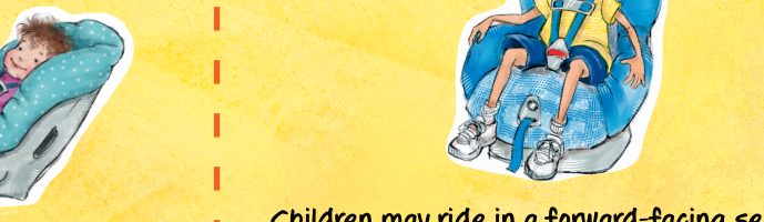
Rear-Facing Infant Only or Rear-Facing Convertible

Your child should ride in a rear-facing seat until he or she reaches the weight limit or height limit of the seat, or is at least two years of age.